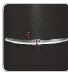
Sturdy Metal Faucet Handles