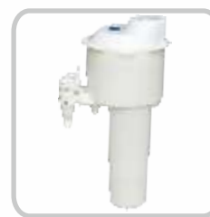
Removable Reservoir/Faucet Assembly (patent pending)