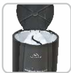
Point of Use Dispenser

Inspired by the award winning Everest model, Crystal Mountain introduces the stunning Everest Elite. Innovative design features include: removable side panels, double mechanical float, and raised faucet handles. Its sleek design and upscale look is perfect for either home or office environments. Crystal Mountain proves that anything is possible when there is a drive to reach new heights!