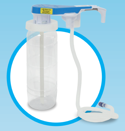
The unique SmartFlo™ water cartridge guarantees 100% sanitization in minutes...